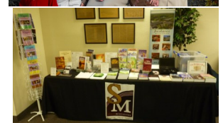
Bottom: Starr Ministry Book Table Ministry