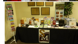
Bottom: Starr Ministry Book Table Ministry